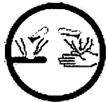
E - Corrosive