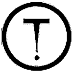
D2B - Toxic

D2B - Toxic materials, Eye Irritation Class E : Corrosive to aluminum. Not corrosive to animal skin or carbon steel.